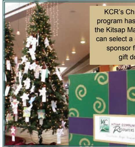
KCR's Christmas Angel program has set up a tree at the Kitsap Mall where families can select a child or family to sponsor for Christmas gift donations.

First Lutheran Community Church in Port Orchard Sponsored by the Women of First Lutheran Community Church, part of the proceeds benefit KCR