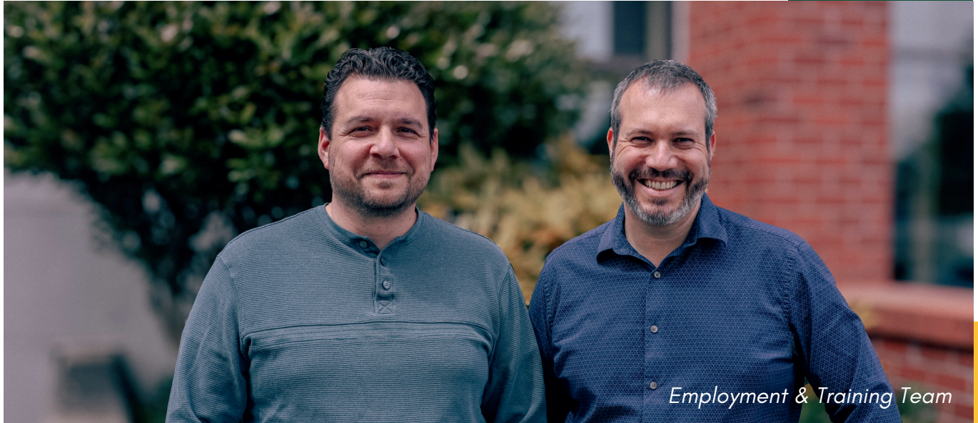
Employment & Training Team

In 2023, Kitsap Community Resources continued to empower individuals through its comprehensive Employment & Training (E&T) programs, comprising four key subsections designed to enhance skills, foster career development, and promote financial stability across Kitsap County.